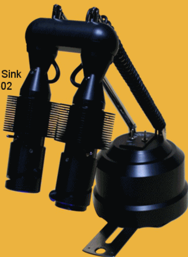
Heat Sink HS-02

Emission filters can be ordered separately according to your specific needs. Since the two separate light sources can be operated independently, dual excitation of different FPs is also possible. The excitation stand can be operated either on batteries or on the included AC/DC adapter.